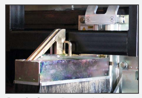
PowerStop® manually operated unit can be set and released easily from the dock with included activation handle.