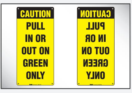
Light package and control panel for additional communication safety.