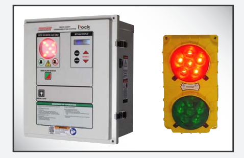
Optional upgraded iDock® Controls include light communication and can be integrated with other dock equipment.