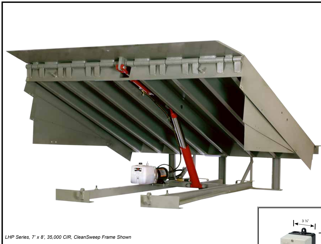
LHP Series, 7' x 8', 35,000 CIR, CleanSweep Frame Shown