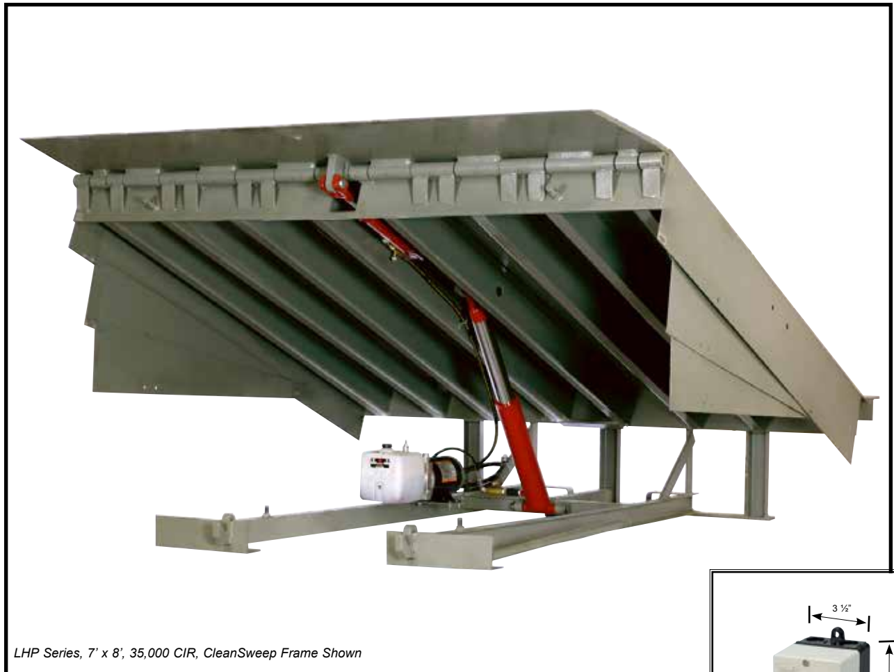
LHP Series, 7' x 8', 35,000 CIR, CleanSweep Frame Shown