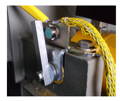
Prox switch mount used after 9/1/2009