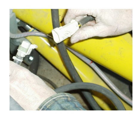
Step 1. Unplug harness & remove guide track.