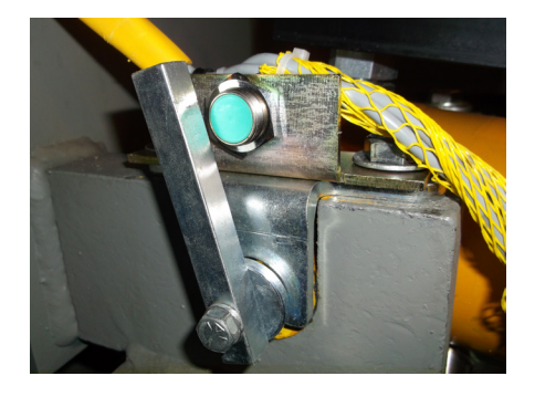
Step 4. Start adjustment at 10 o'clock position. Rotate clockwise to raise hook or counter-clockwise to lower. When adjustments are complete, top of hook should be 6" to 8" off the apron at full extension. See PowerHook Owner's/User's Manual for more detailed adjustment instructions.