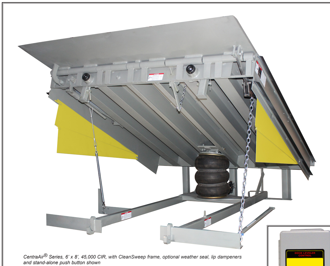
CentraAir® Series, 6' x 8', 45,000 CIR, with CleanSweep frame, optional weather seal, lip dampeners and stand-alone push button shown