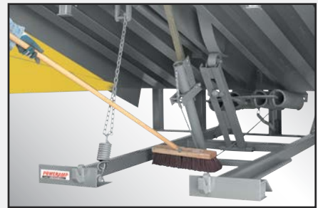
CleanSweep Frame allows unobstructed access to the pit area.