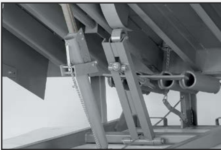
Cam Control Counter Balance Assembly permits smooth ramp extension and easy walk-down of the leveler.