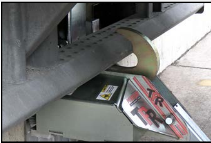
The TPR® hook rotates up to engage the RIG and secure the trailer to the loading dock.