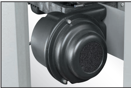
High volume, low pressure air blower to efficiently raise the leveler.