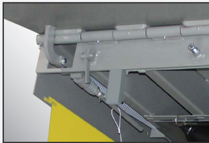
Unique lip latching mechanism provides positive, full height lip extension.