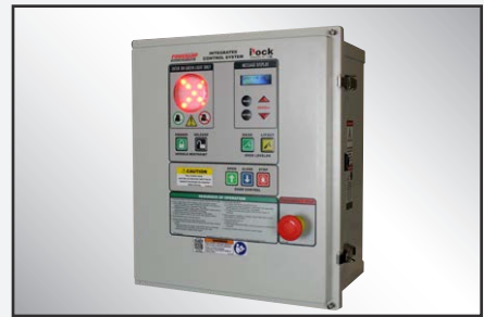
Optional iDock® Controls with online connection to myQ® Dock Management.