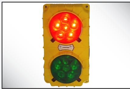
Exterior Lights - standard with LED for longer life.