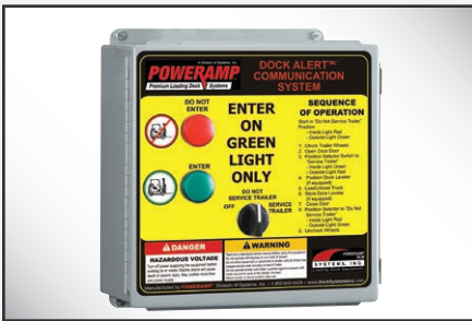
Dock Alert Communication System Control panel for automatic lights - manual light control panel similar.