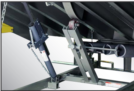
Cam Control Counter Balance Assembly permits smooth ramp extension and easy walk-down of the leveler.