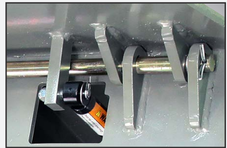
"Box construction" deck with a heavy duty lug hinge design.