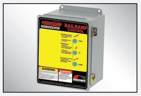
Constant pressure up, down and lip buttons provide continuous control to the operator.