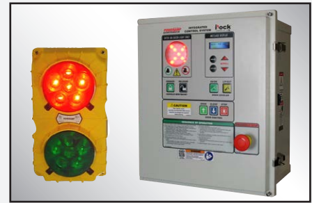
iDock® Controls includes light communication and can be integrated with other dock equipment.