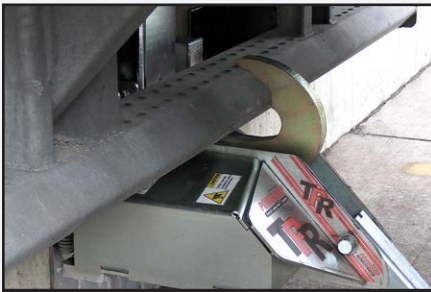
The TPR® hook rotates up to engage the RIG and secure the trailer to the loading dock.