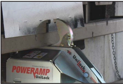
Locking mechanism maintains engagement even on intermodal trailers or an obstructed Rear Impact Guard (RIG).