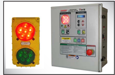
iDock® Controls includes light communication and can be integrated with other dock equipment.