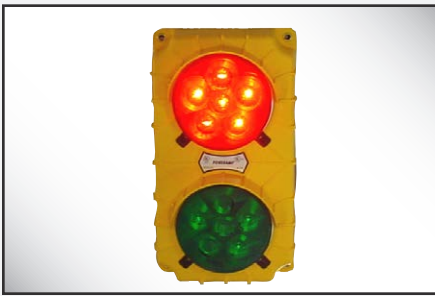
Exterior Lights - LED for longer life.