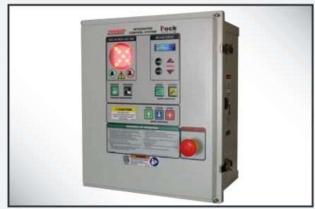
Upgrade to iDock® Controls with optional integrated equipment for a more efficient loading dock.

The iDock Alert Light Communication System is an enhanced version of Poweramp's simple Dock Alert and provides a reliable warning system that establishes a clear line of communication between truck drivers and dock personnel, thereby reducing the risk of accidents at the loading dock.