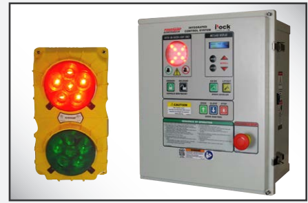
UniChock includes light communication and can be integrated with other dock equipment.