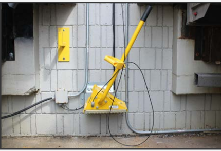
Easily stored and away from damage or debris.