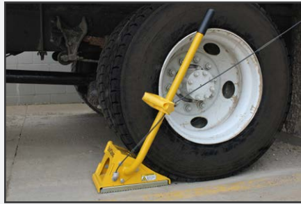
Secure grip to the ground with audible indicators if in unsafe position during loading.