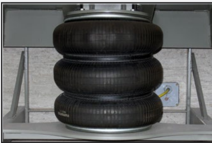
Steel belted rubber bellows system uses compressed air to raise platform.