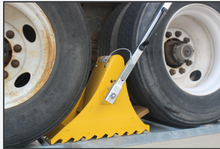
The chock system is installed with an articulated arm and ground plate to lock the chock in position.