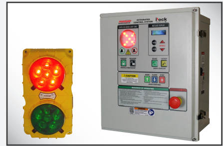
Includes light communication and can be integrated with other dock equipment in one controller.