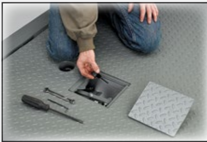
Maintenance inspection plate in the deck to allow for maintenance above the dock.