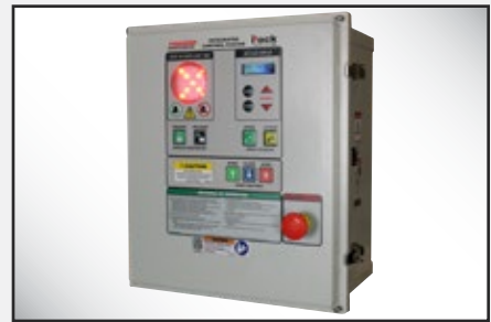
Optional iDock® Controls with online connection to myQ® Enterprise.