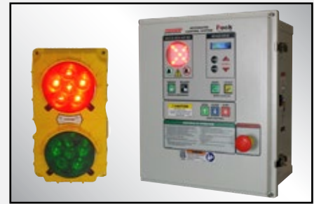
iDock® Controls includes light communication and can be integrated with other dock equipment.