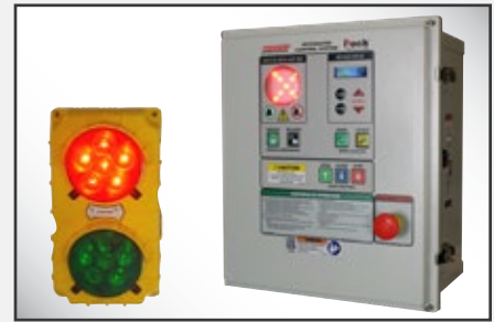
Includes light communication and can be integrated with other dock equipment in one controller.