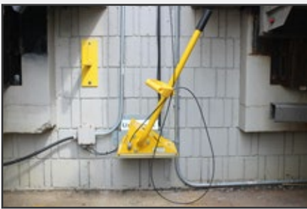
Easily stored and away from damage or debris.