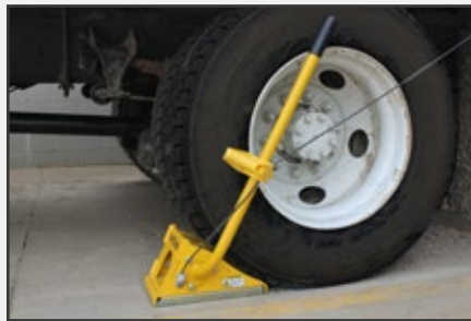
Secure grip to the ground with audible indicators if in unsafe position during loading.