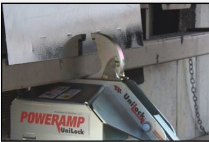
Locking mechanism maintains engagement even on intermodal trailers or an obstructed Rear Impact Guard (RIG).