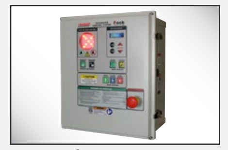
Optional iDock® Controls with online connection to myQ® Enterprise.