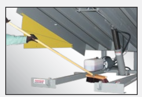
CleanSweep Frame Design.