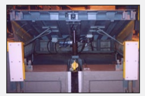
Automatic positioning bumpers eliminate interference with pit walls.