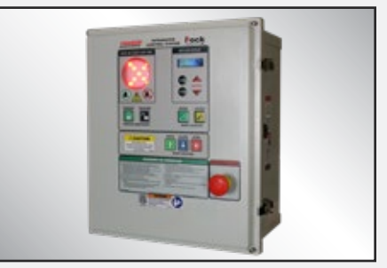
Optional iDock<sup>®</sup> Controls with online connection to myQ<sup>®</sup> Enterprise.