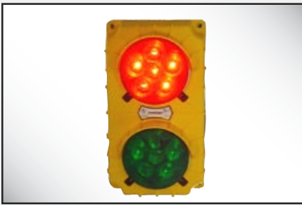
Exterior Lights - LED for longer life.