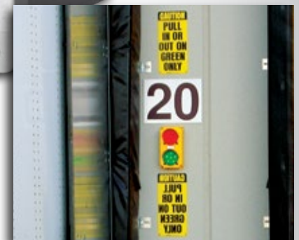
* iDock Alert controls shown with optional dock light button.