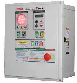
Integrated Control Panel Shown (Size varies with options)

WARRANTY: All PowerStop® vehicle restraints feature a full one (1) year base warranty on all structural, hydraulic and electrical parts, including freight and labor charges in accordance with Systems, LLC's Standard Warranty Policy. Systems, LLC warrants all components to be free of defects in materials and workmanship, under normal use, during the warranty period. This base warranty period begins upon the completion of installation or the sixtieth (60th) day after shipment, whichever is earlier.