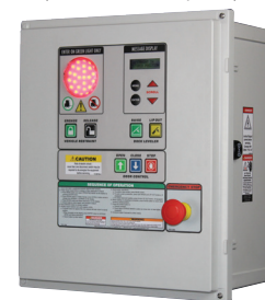
Integrated Control Panel Shown (Size varies with options)

WARRANTY: All UniLock vehicle restraints feature a full one (1) year base warranty on all structural, mechanical and electrical parts, including freight and labor charges in accordance with Systems, LLC's Standard Warranty Policy. Systems, LLC warrants all components to be free of defects in materials and workmanship, under normal use, during the warranty period. This base warranty period begins upon the completion of installation or the sixtieth (60th) day after shipment, whichever is earlier.