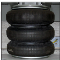
Steel belted rubber bellows system uses compressed air to raise platform.