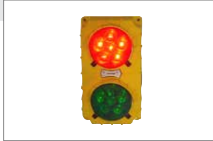
Exterior lights are standard with LED for extended life.