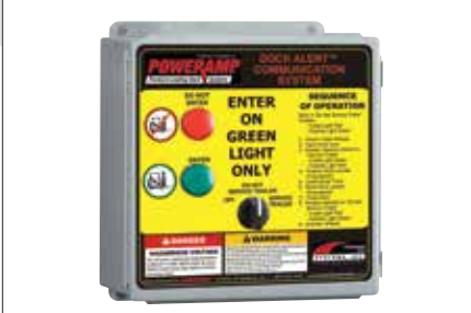
Dock Alert Communication System control panel for automatic lights - manual light control panel similar.