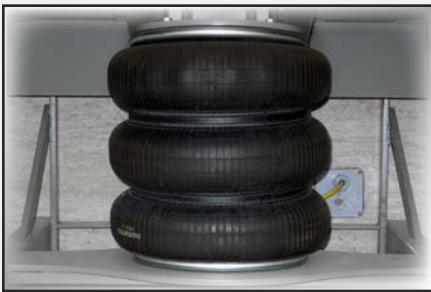
Steel belted rubber bellows system uses compressed air to raise platform.