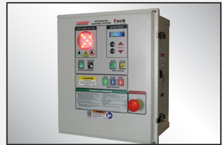
Optional iDock® Controls with online connection to myQ® Dock Management.