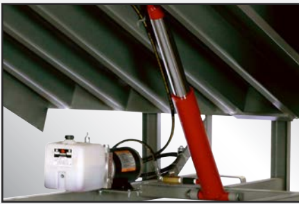
Translucent Hydraulic Reservoir.