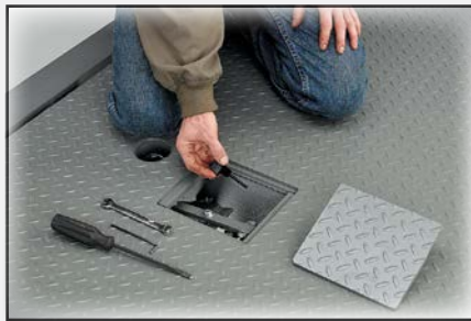
Maintenance inspection plate in the deck to allow for maintenance above the dock.