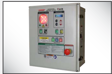
Optional iDock® Controls with online connection to myQ® Dock Management.