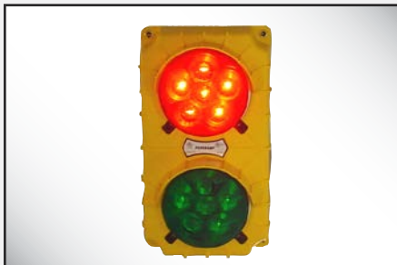
Exterior Lights - LED for longer life.