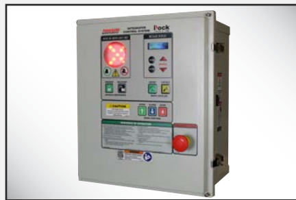
Upgrade to iDock® Controls with optional integrated equipment for a more efficient loading dock.

The iDock Alert Light Communication System is an enhanced version of Poweramp's simple Dock Alert and provides a reliable warning system that establishes a clear line of communication between truck drivers and dock personnel, thereby reducing the risk of accidents at the loading dock.