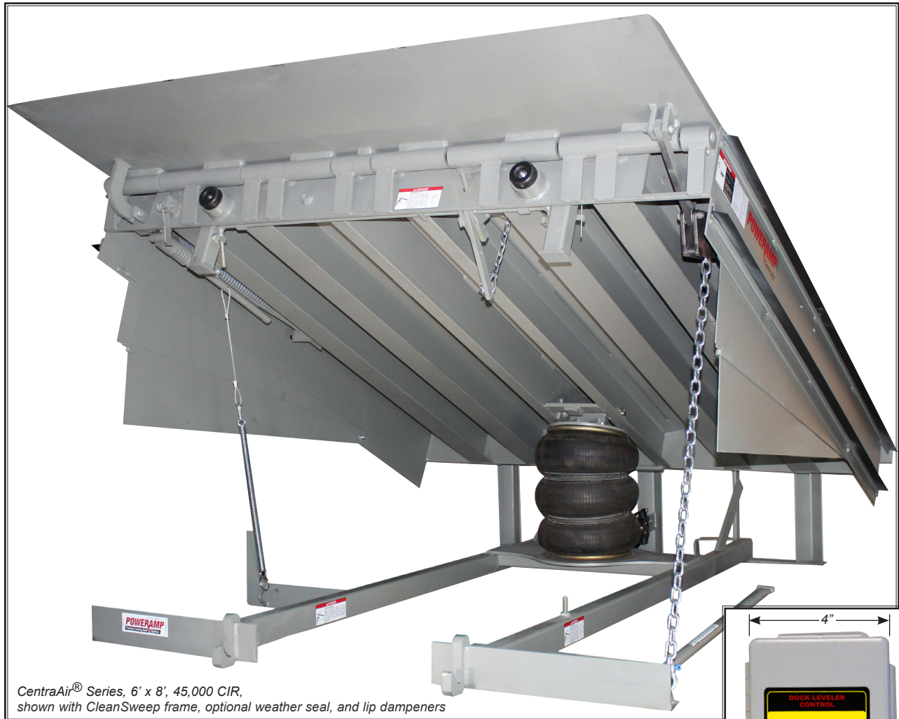
CentraAir® Series, 6' x 8', 45,000 CIR, shown with CleanSweep frame, optional weather seal, and lip dampeners