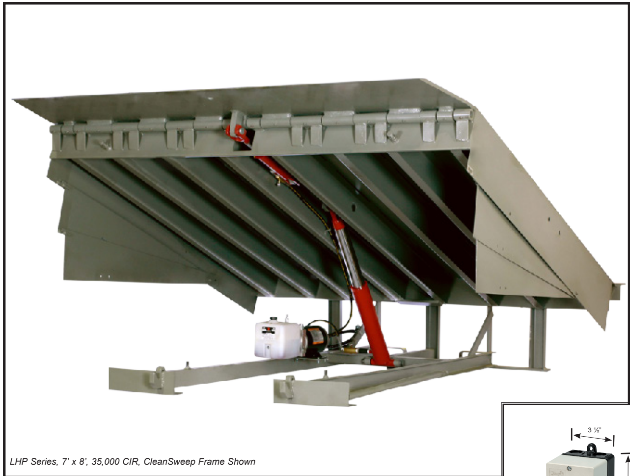
LHP Series, 7' x 8', 35,000 CIR, CleanSweep Frame Shown