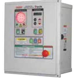
Integrated Control Panel Shown (Size varies with options)

WARRANTY: iDock Controls feature a full one (1) year base warranty on all structural, mechanical and electrical parts, including freight and labor charges in accordance with Systems, LLC's Standard Warranty Policy. Systems, LLC warrants all components to be free of defects in materials and workmanship, under normal use, during the warranty period. This base warranty period begins upon the completion of installation or the sixtieth (60th) day after shipment, whichever is earlier.