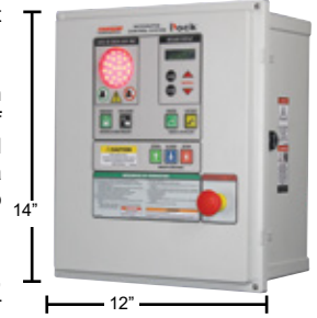
Integrated Control Panel Shown (Standard Size)

WARRANTY: iDock Controls feature a full one (1) year base warranty on all structural, mechanical and electrical parts, including freight and labor charges in accordance with Systems, LLC's Standard Warranty Policy. Systems, LLC warrants all components to be free of defects in materials and workmanship, under normal use, during the warranty period. This base warranty period begins upon the completion of installation or the sixtieth (60th) day after shipment, whichever is earlier.