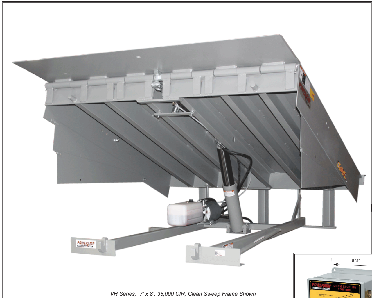
VH Series, 7' x 8', 35,000 CIR, Clean Sweep Frame Shown