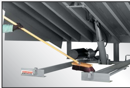
CleanSweep Frame Design.