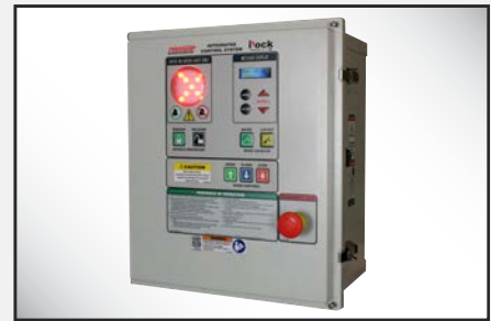
Optional iDock® Controls with online connection to myQ® Dock Management.